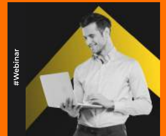
#Webinar Seamless integration with Anaplan using the Integration Utility: ' Wormhole '