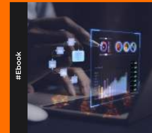
#Ebook Mastering Anaplan Integration

If you want to know more about capabilities of Anaplan integration – here are few resources that might help!